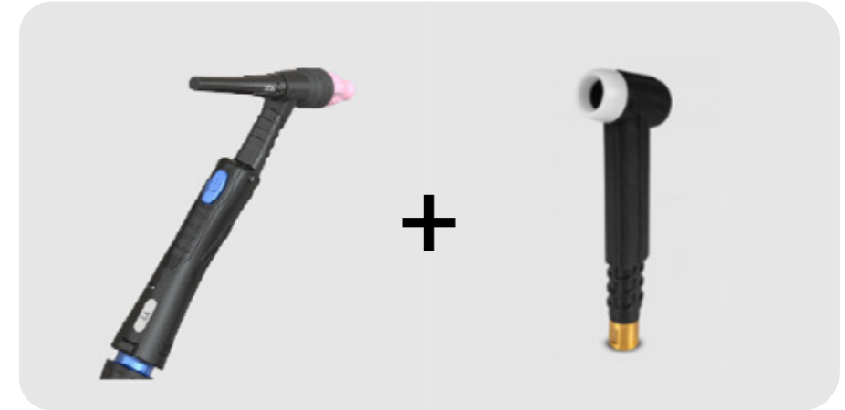
ARC TORCHOLOGY T2 + 17/26 CONVERSION HEAD