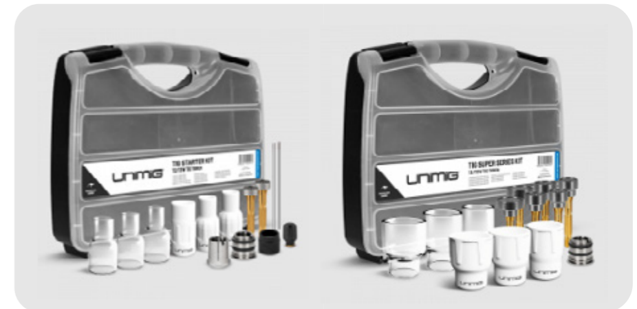
T2 STARTER KIT