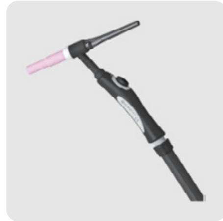
SR17 + SR18 (WATER COOLED)